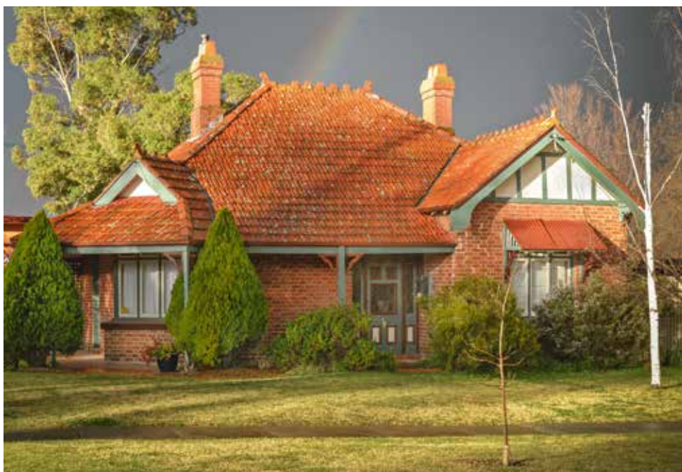
Attributed to Tait and Oakes, c1896 this home at 59 Piper Street, Bathurst, has typical Queen Anne characteristics such as the angled corner bay and the dominant tiled roof.