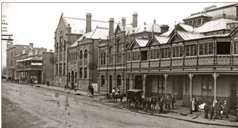
A classic view looking up William Street, Bathurst, c1913, with Copeman's library in the centre. Great harmony in the buildings was created despite the involvement of four architects – Sadleir, Hine, Copeman and Kemp.