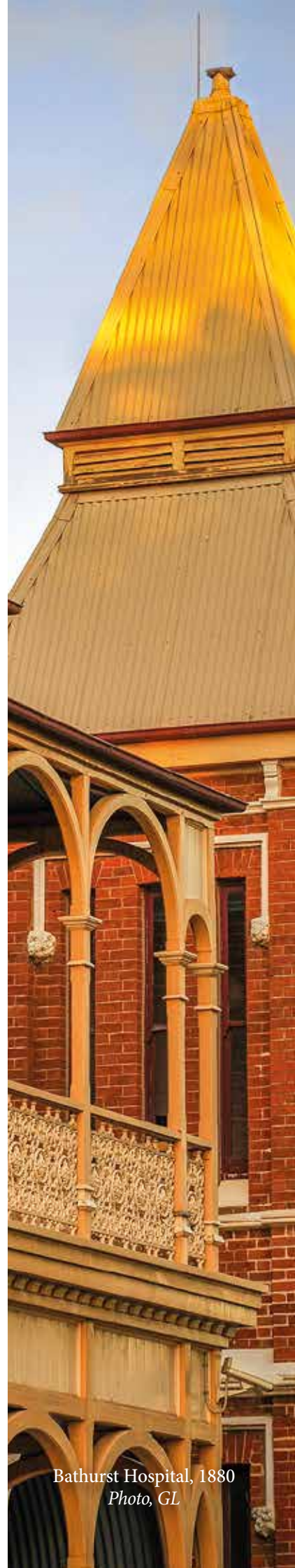
Bathurst Hospital, 1880 Photo, GL

Appendix: The White Way- The Creation of Bathurst's Street Lamps.